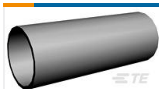
TE Part # 4-1393561-2 V42254A6112L 1=SUB D KONTAKTH